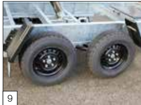
Standard: tyres 185/70 R13 C with black rims.