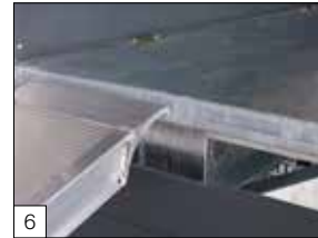
Standard: provided with a U profile at the rear, to put on the loading skids.