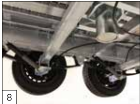
Standard: parabolic leaf spring including shock absorbers on the axles.