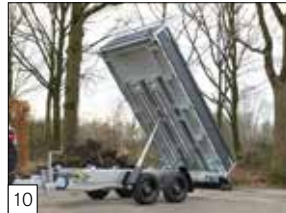
Standard: Ferro floor mounted; single, hot-dipped galvanised steel floor plate with a thickness of 3 mm.