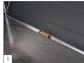
Standard: provided with binding brackets with a capacity of 1000 daN, integrated in the side walls.