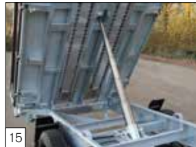
Standard: reinforced frame with massive 5-steps cylinder mounted.