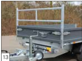
Standard: reinforced removable front rack mounted; hinged front wall.