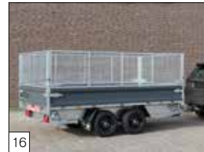
Option: wire-mesh rack with a height of 700 mm, including fasteners. Removable and pendulating.