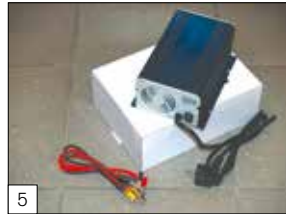
Standard: battery charger (not mounted).