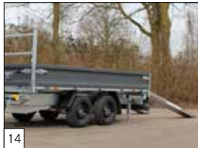
Standard: 'DRIVE-ON' package: 2 reinforced loading skids in aluminium, with a length of 2500 mm with 2 heavy-duty, adjustable prop stands.