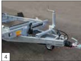
Standard: equipped with emergency hand pump next to electric pump.