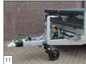
Standard: reinforced jockey wheel at the front.