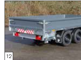
Standard: steel walls with a height of 350 mm (with electrocoating (KTL) and provided with powder coating) and rear-light protection mounted.