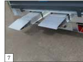
Standard: reinforced aluminium loading skids with a length of 2500 mm, integrated underneath the floor.