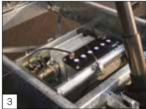
Standard: electric control powered by a battery enclosed in a steel box with plastic cover.